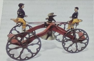
Figure 1. Perkins patented bell toy, collection of Robert Watrous 7 1/2" Height x 5" Length x 3 1/4" Width

Perkins, of East Hampton Connecticut, "Mechanical Toy" that resembles a seesaw wheel pull toy. (Figure 2) This may be a bell toy to emulate a now common playground equipment. The patent date is close to Perkins left the firm of Gong Bell to pursue his dreams. According to the firm of Gong Bell in 1884