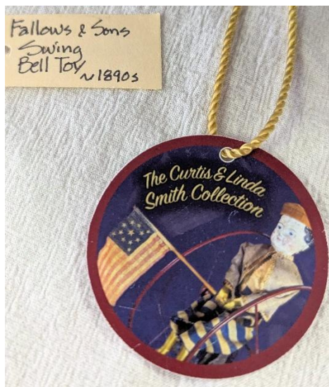
See the article about this bell - Early See-Saw Bell Toys - The Bell Tower - March-April 2025