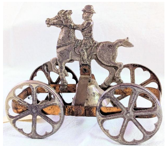
Possibly Ulysses S. Grant and soldiers Watrous Mfg Co. or J.L. Watrous Co., East Hampton, CT, Early 1800s