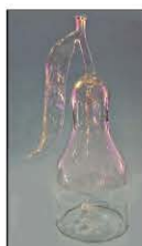
Millefiori; frosted w/ bird handle; 4.5"; Trinidad 1, p.153; #145...$45 (left below)