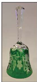
Imperial; end-of-day bell; swirls brown and white; 5 3/4"; #113...$40 (below left)